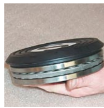
Ball bearing for turning plate